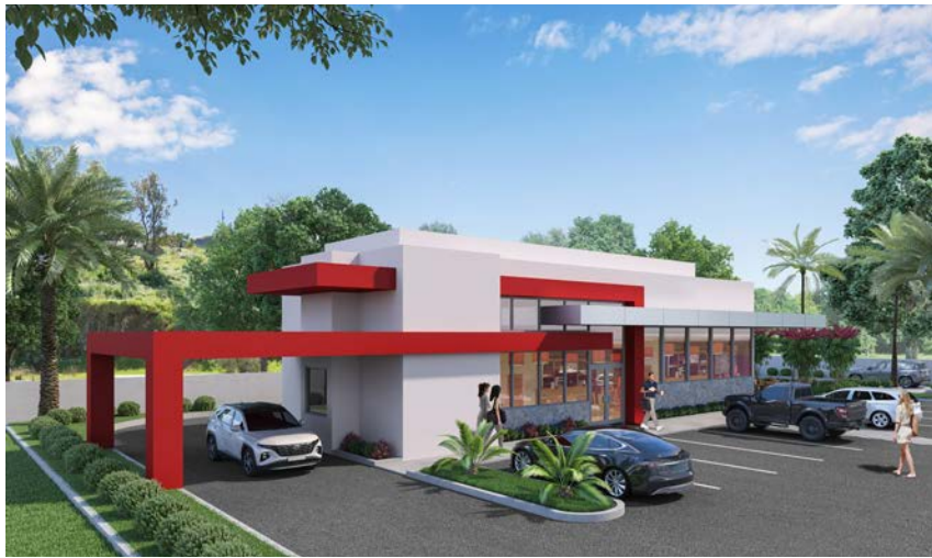
FRONT NORTH ELEVATION