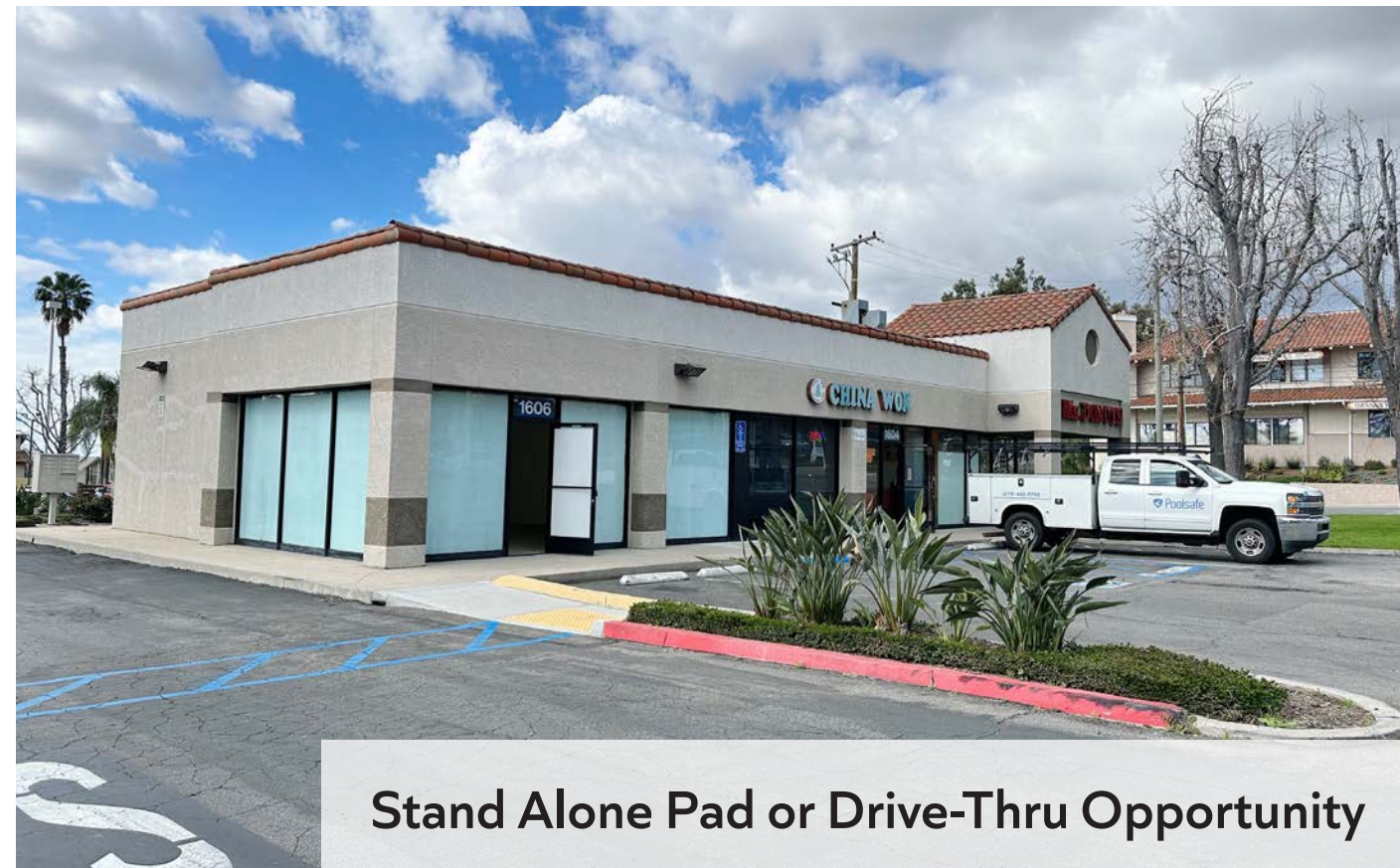
Stand Alone Pad or Drive-Thru Opportunity