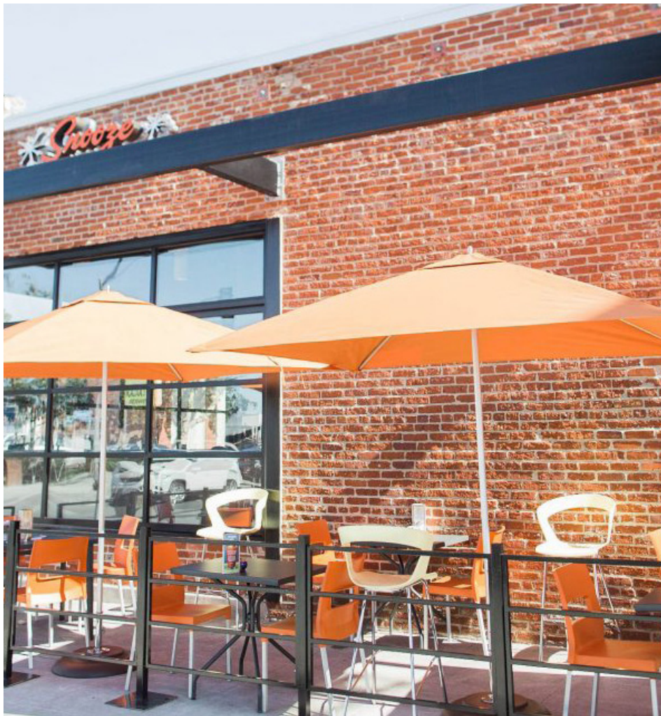
ORANGE / CALIFORNIA