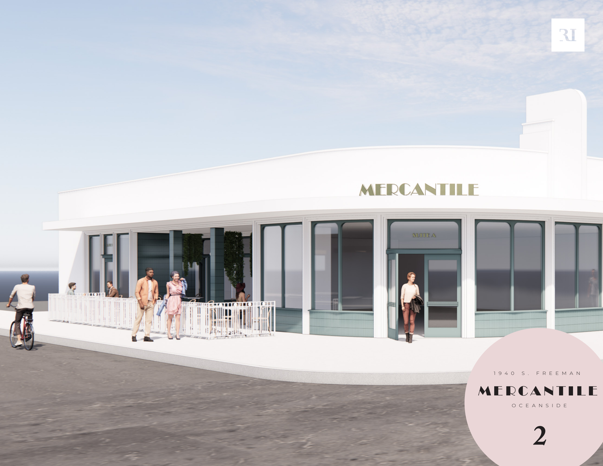
1940 S. FREEMAN MERCANTILE OCEANSIDE 2