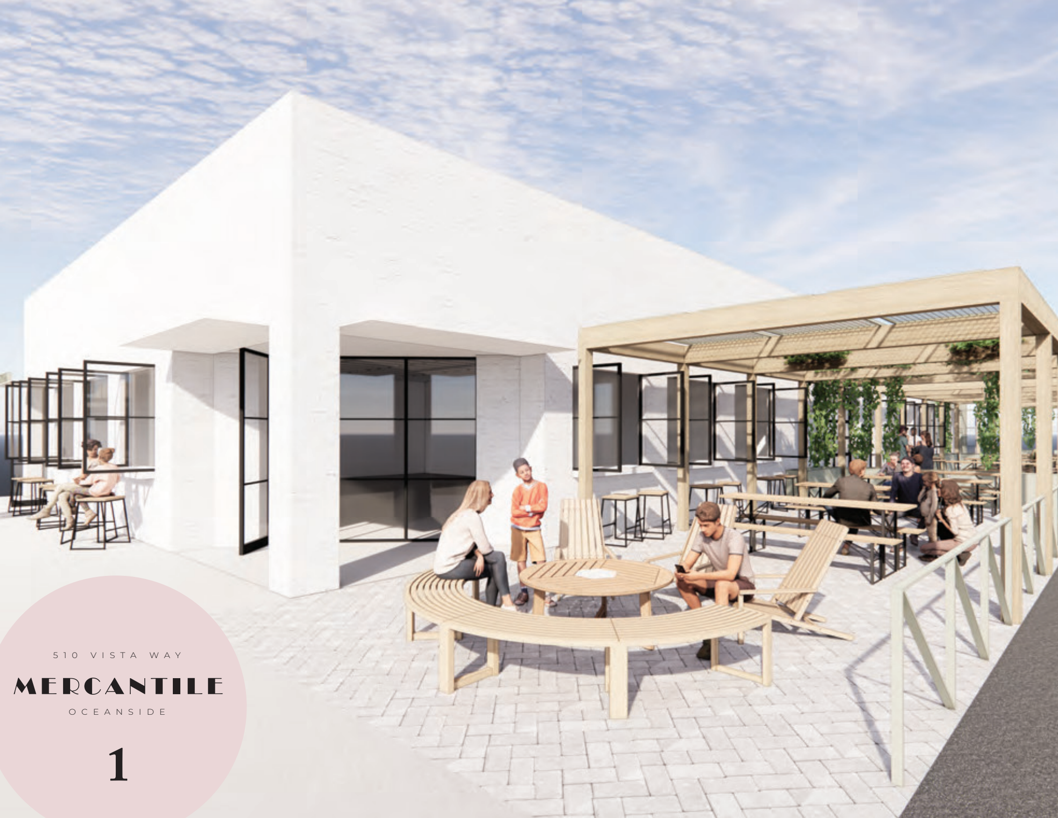
510 VISTA WAY MERCANTILE OCEANSIDE 1