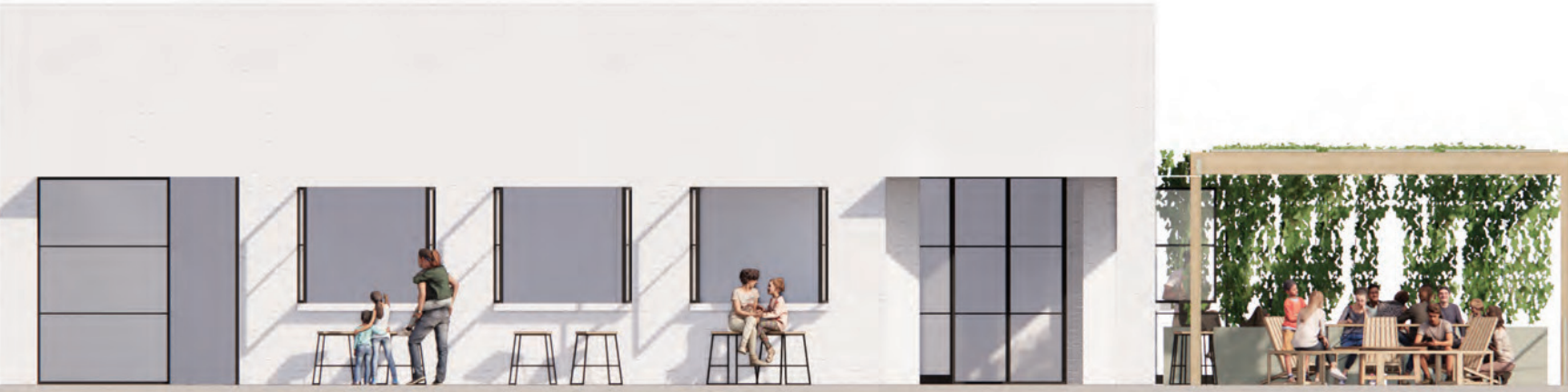
ANCHOR EXTERIOR PATIO