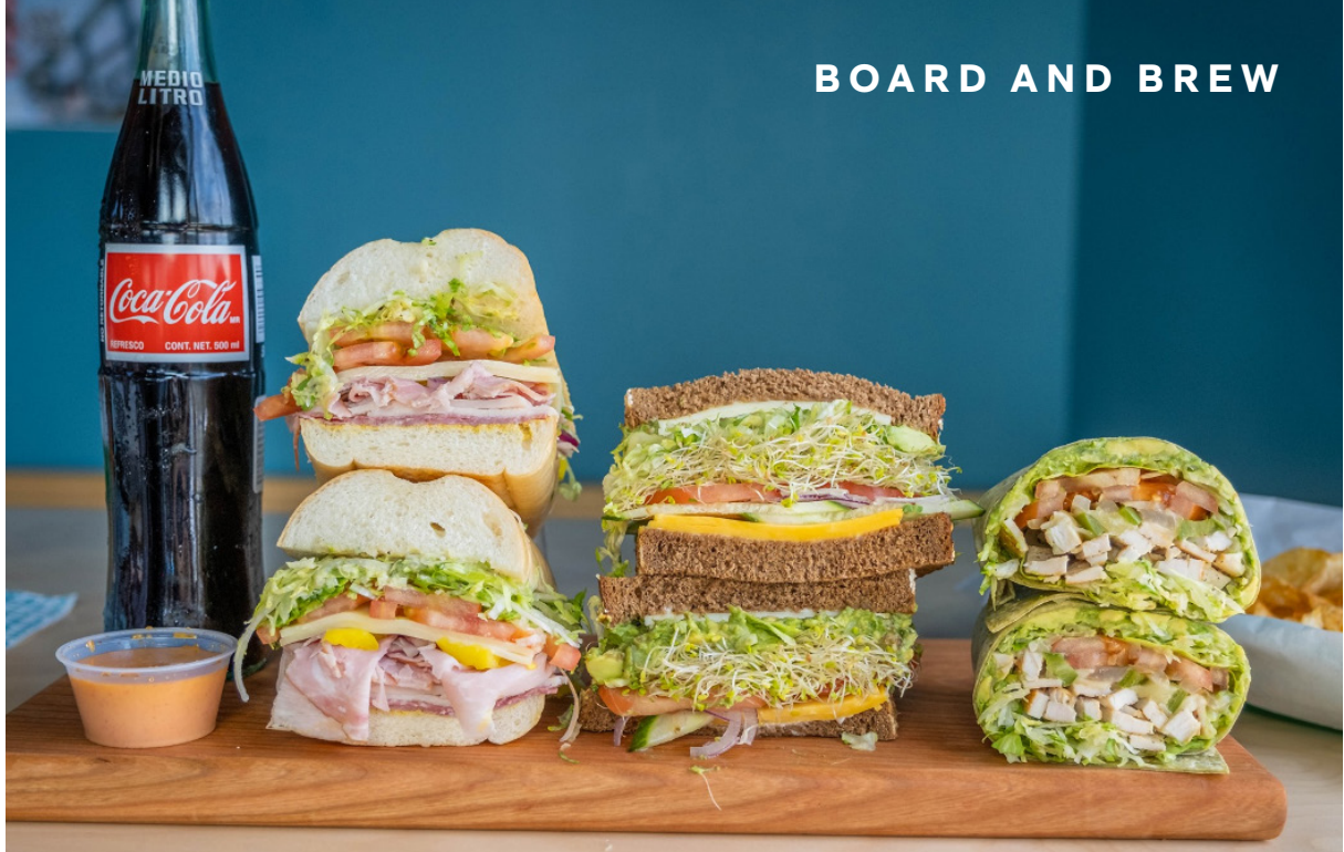
BOARD AND BREW