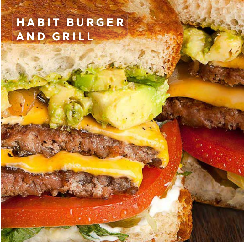
HABIT BURGER AND GRILL