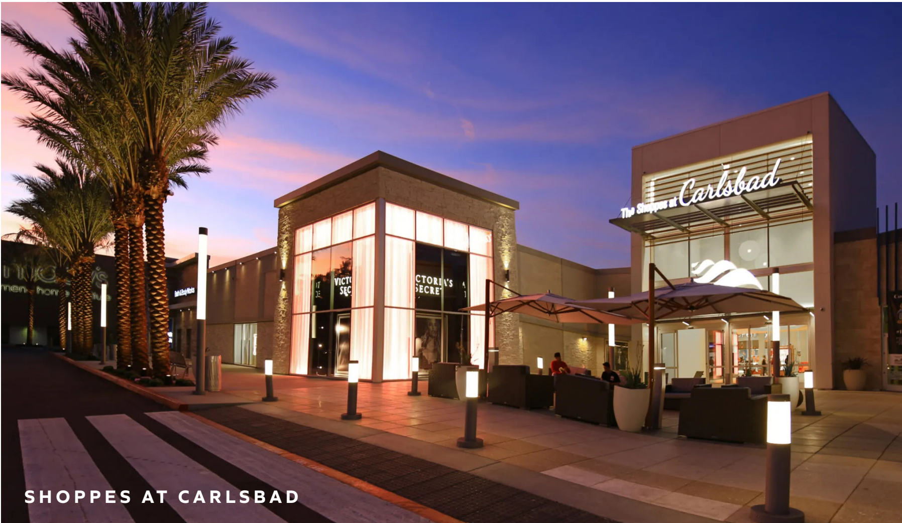
SHOPPES AT CARLSBAD