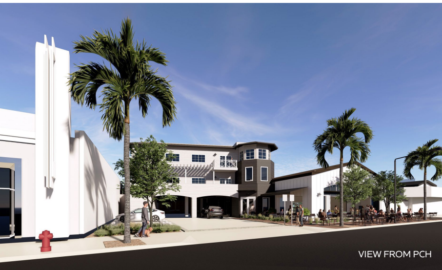
VIEW FROM PCH