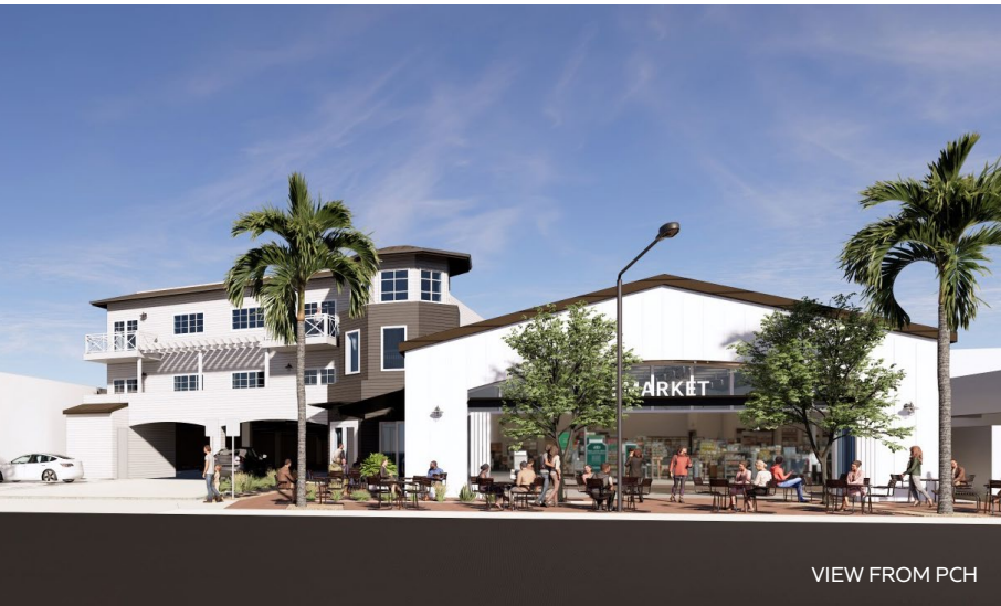
VIEW FROM PCH