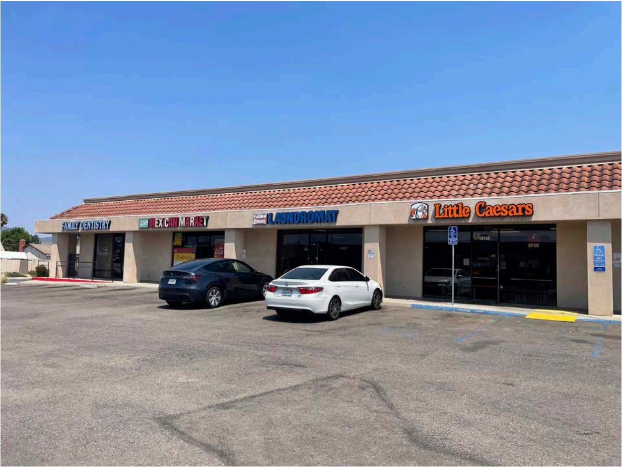
M I R A M E S A / C A L I F O R N I A