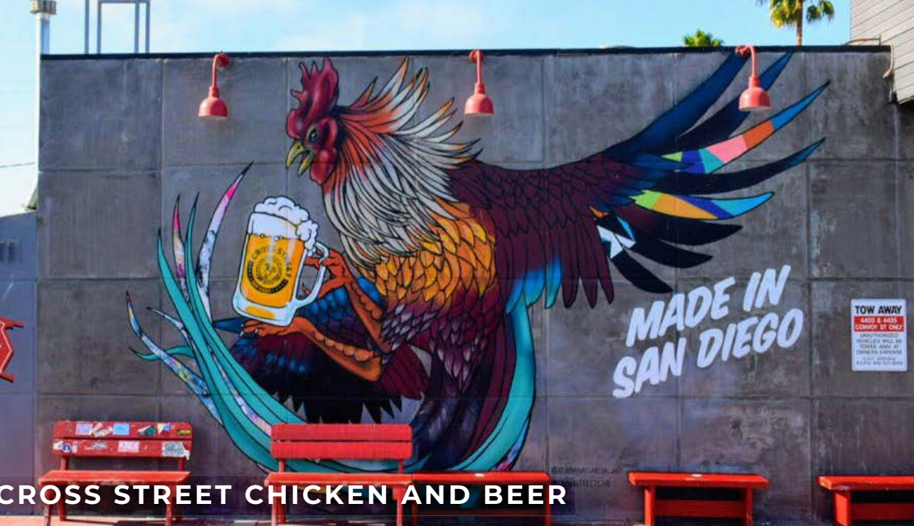
CROSS STREET CHICKEN AND BEER