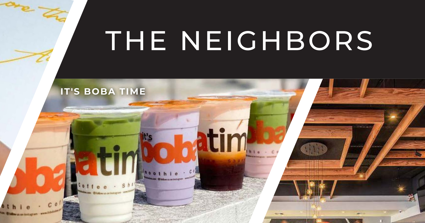
IT'S BOBA TIME