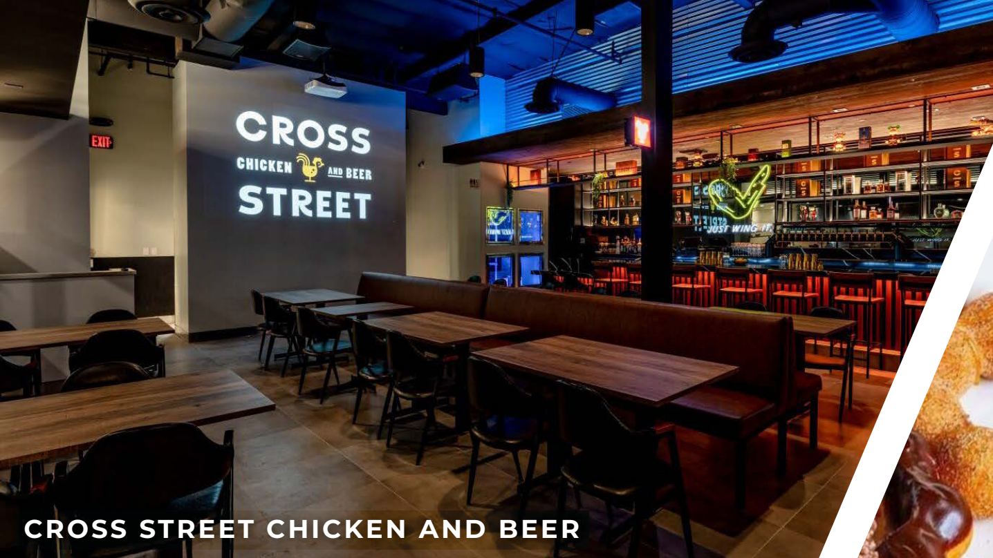
CROSS STREET CHICKEN AND BEER