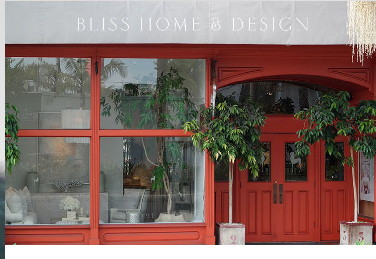
BLISS HOME & DESIGN