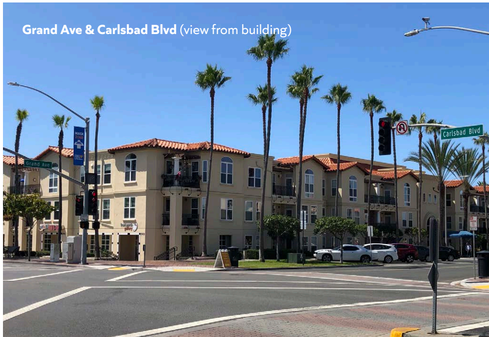
Grand Ave & Carlsbad Blvd (view from building)

Koko Beach PRIME RIB • STEAK • SEAFOOD LUNCH Monday - Friday 11:00 AM to 4:00 PM Saturday & Sunday 10:00 AM to 4:00 PM DINNER Everyday 4:00 PM to Midnight LOUNGE Monday - Friday 11:00 AM to Midnight Saturday & Sunday 10:00 AM to Midnight 760 634 6868 www.kokobeach.com