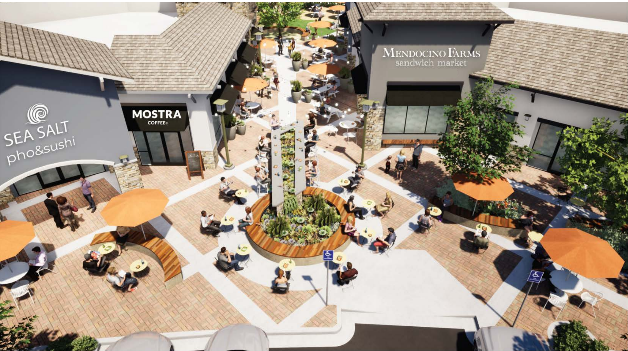
REIMAGINED COMMON AREAS, PATIOS, AND GREENSPACE PROMOTING COMMUNITY ENGAGEMENT AND CONNECTIVITY